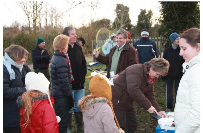
With cake and mulled wine