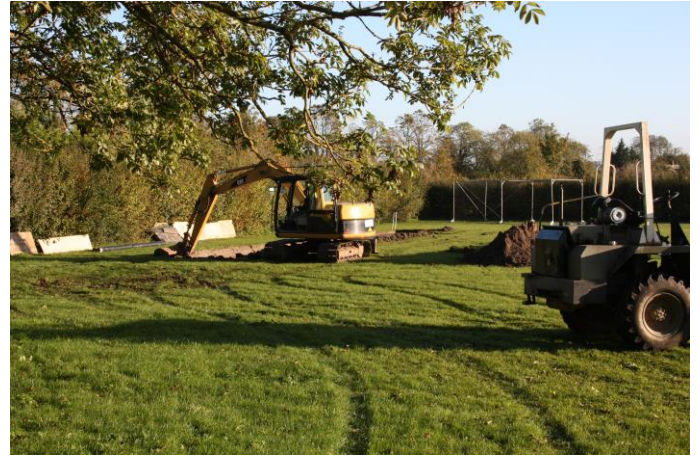
Court construction started on the 25 th October 2010