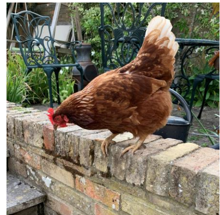
Lost chicken! – thankfully, owners found