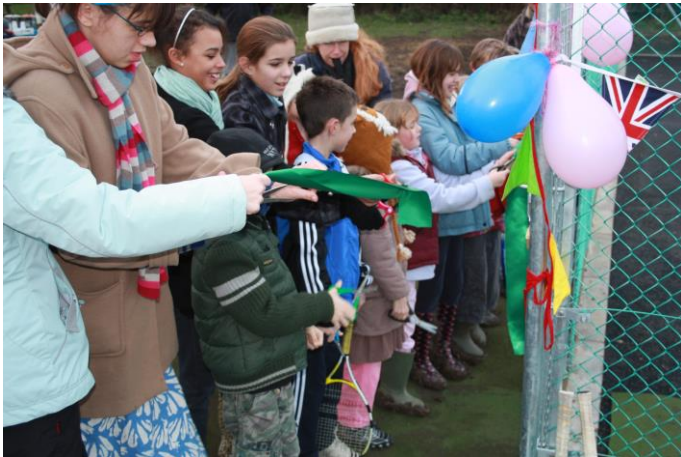
The formal opening took place on 5 th December 2010