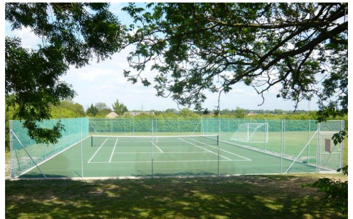
The court was finally painted in May 2011

Since being painted 10 years ago, the court has been well used – at no cost to villagers, which was always the intention. Maintenance funding has come from coaching, donations, a tennis ladder and the Racquet Master Tennis Championships!