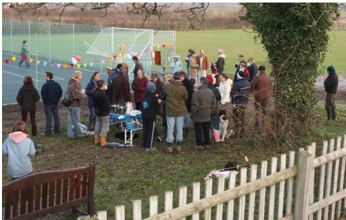
There was a good turnout