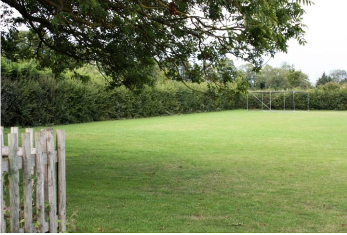
The playing field as it was in August 2010